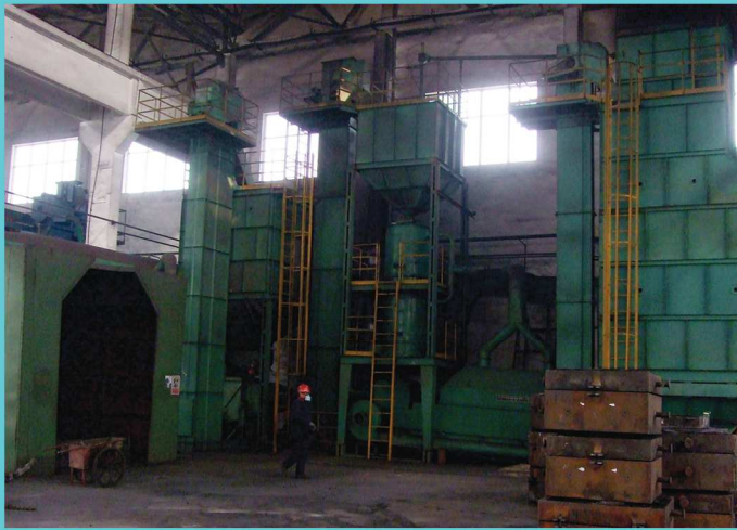
落砂机, 再生机和砂库 (Shakeout Machine, Then Vitality And Sand Reclaimer)