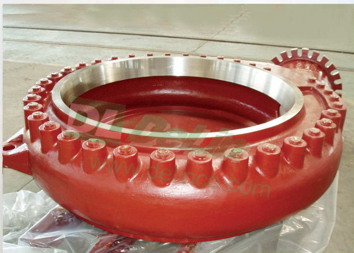
泵体 (Cr27%, 6吨/件) (Frame Plate) (Cr27 %, 6 t/pce)