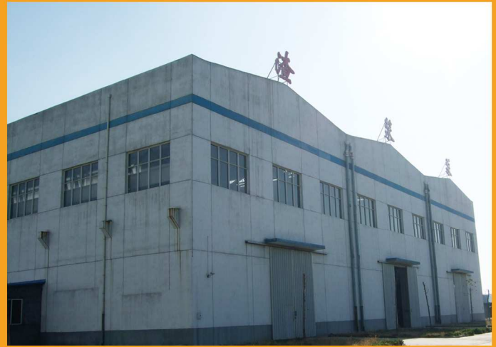
铸造车间 (Casting Workshop)