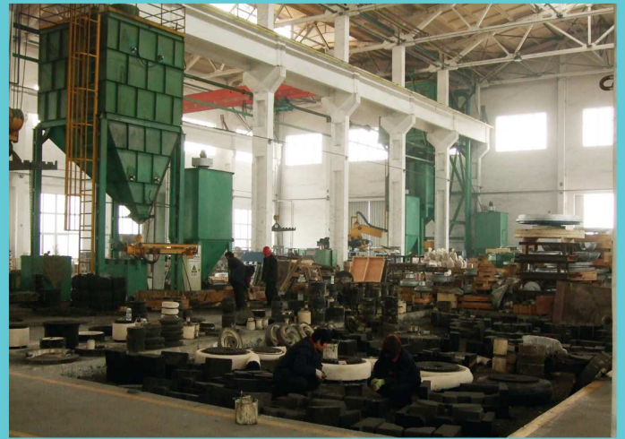
制芯区 (Core Making Area)