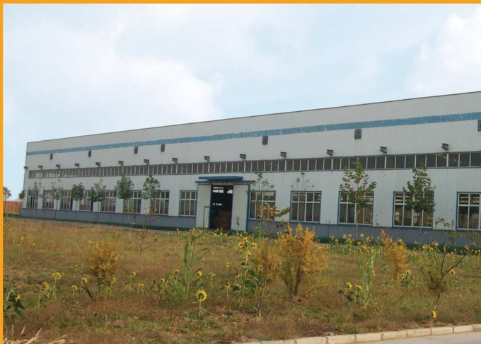
装配车间 (Assembly Workshop)