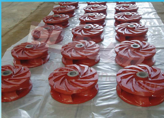
待发叶轮 (Impeller For Shipping)