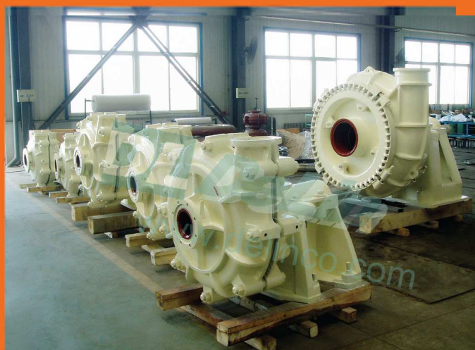
待发泵 (Pump For Shipping)