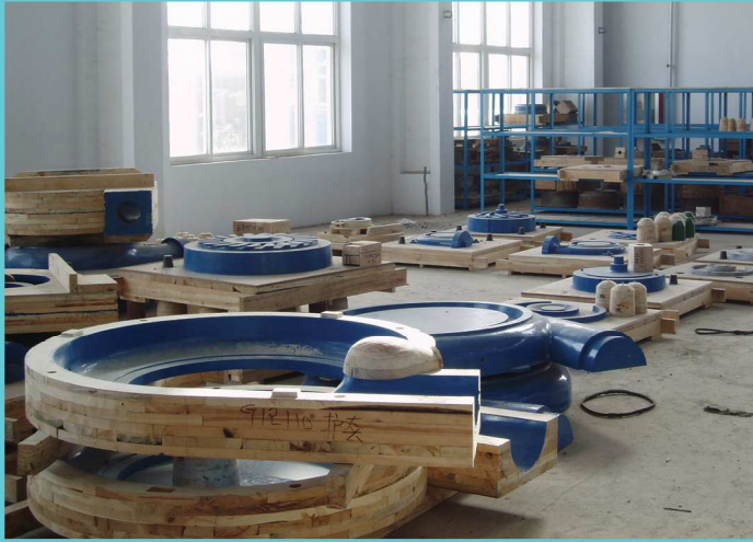
造型区 (Modeling Area)