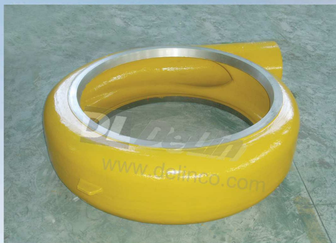
护套 (Volute Liner)