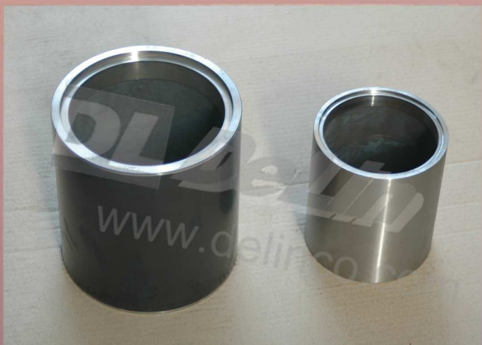
陶瓷轴套和轴套 (G075 And D075) (Ceramic And Standard)