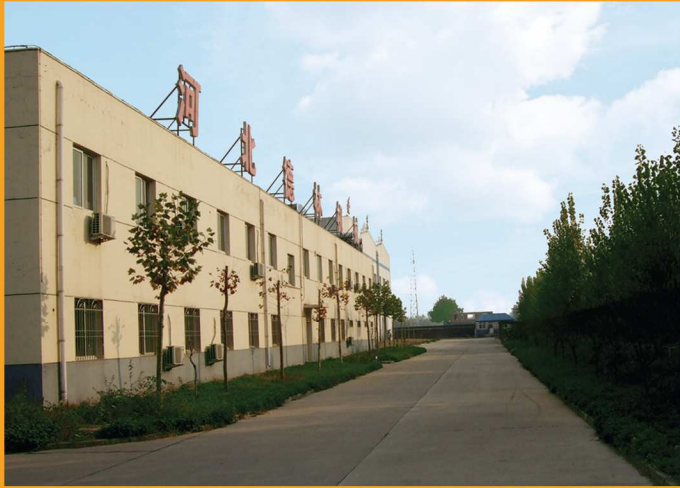
机加工车间 (Machining Workshop)