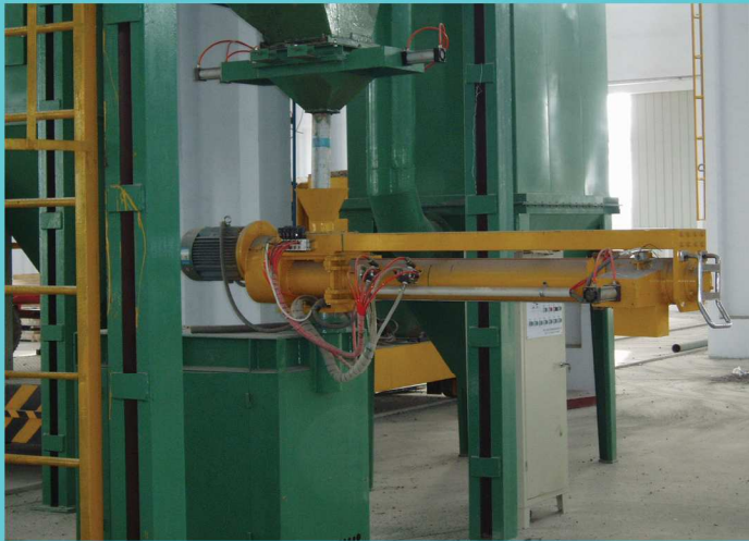
制芯机 (Core Making Machine)