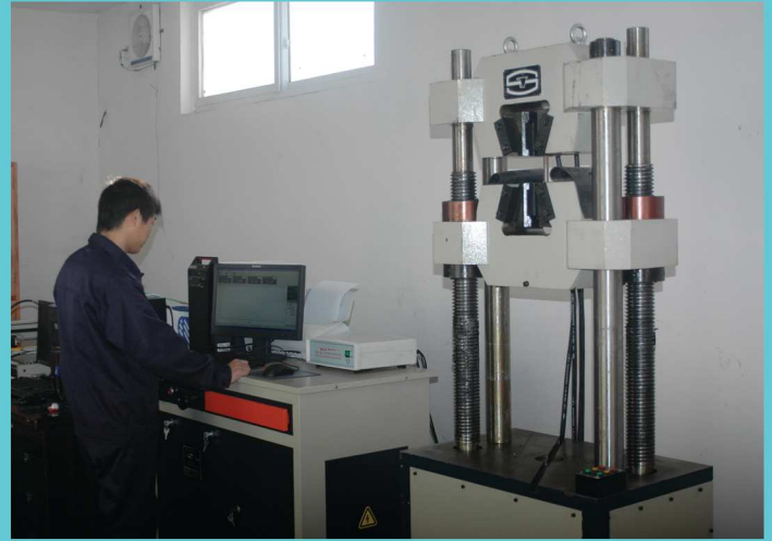
拉力测试 (Tensile Test)