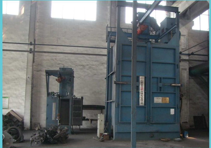
一吨和五吨抛丸机 (A Ton And Five Ton Shot Blasting Machine)