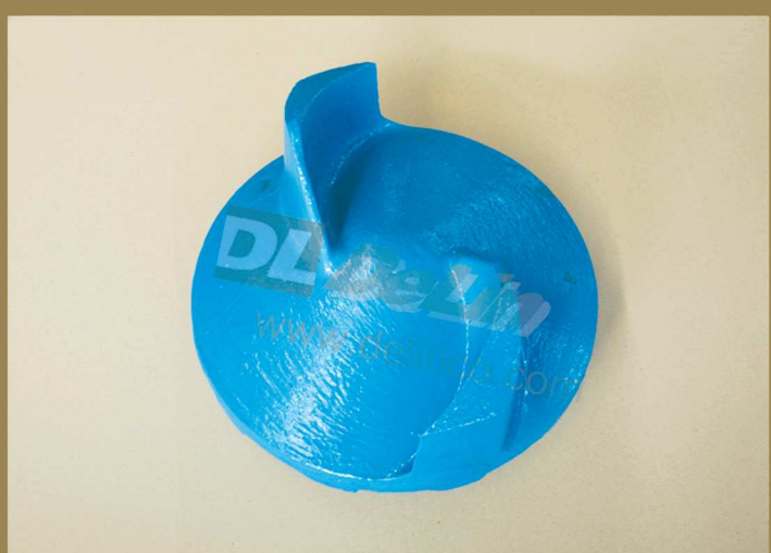
叶轮 (86051) (Impeller)