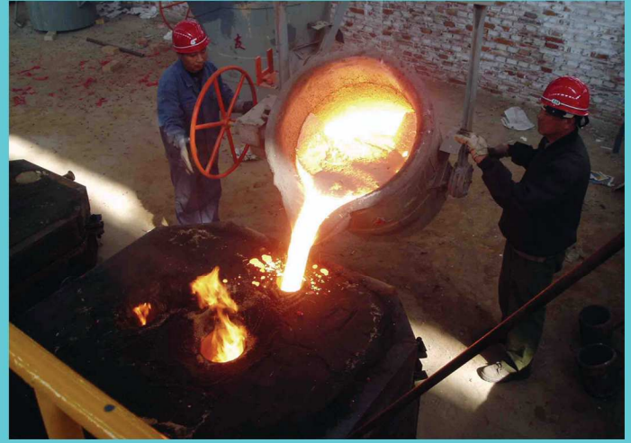
铁水浇注 (Molten Iron Casting)