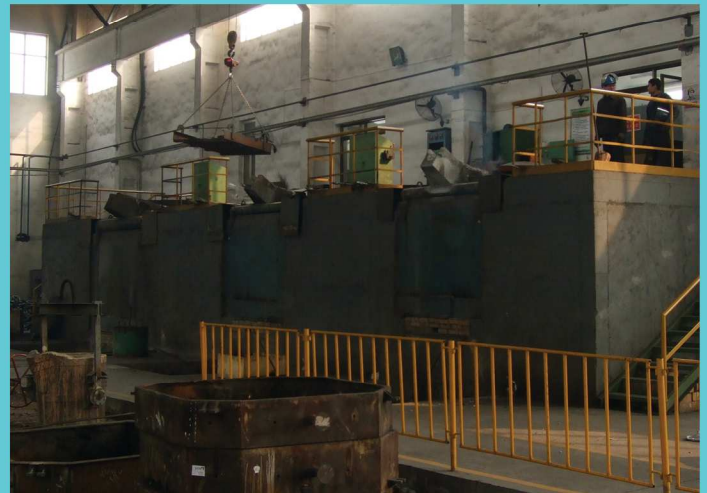
工频炉 (Induction Frequency Furnace)