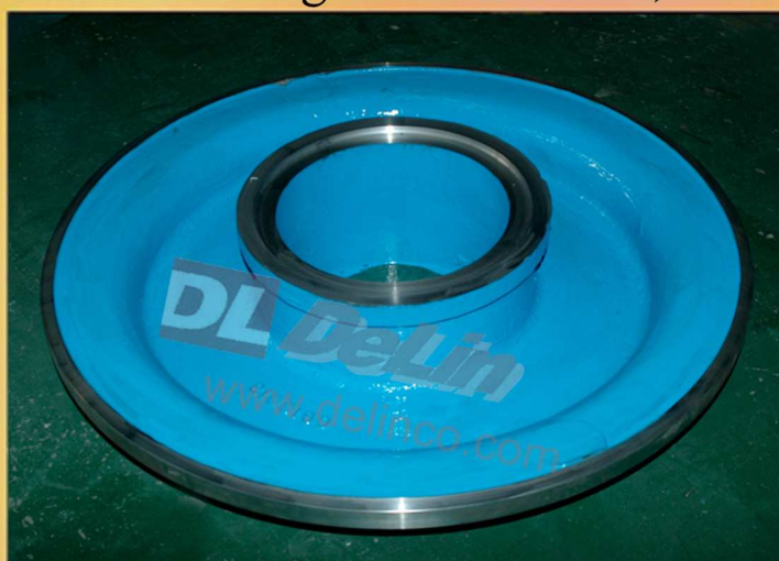
泵盖 (GG10013) (Cover Plate)