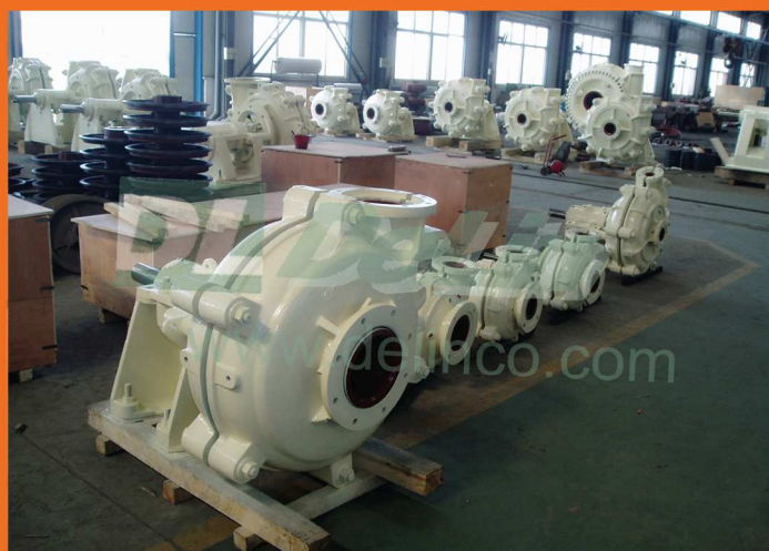
待发泵 (Pump For Shipping)