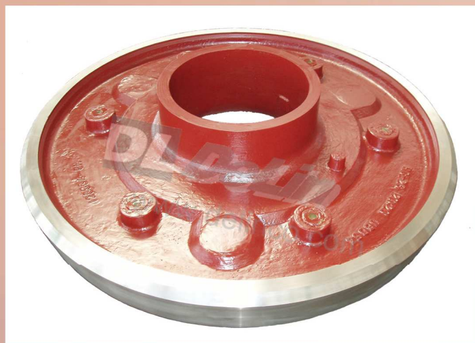
吸入护板 (Suction Liner) (高铬, 1240公斤/件) (High Chrome Alloy, 1240kg/pce)