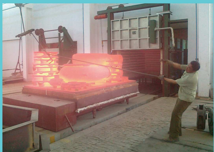
热处理区 (Heat Treatment Area)