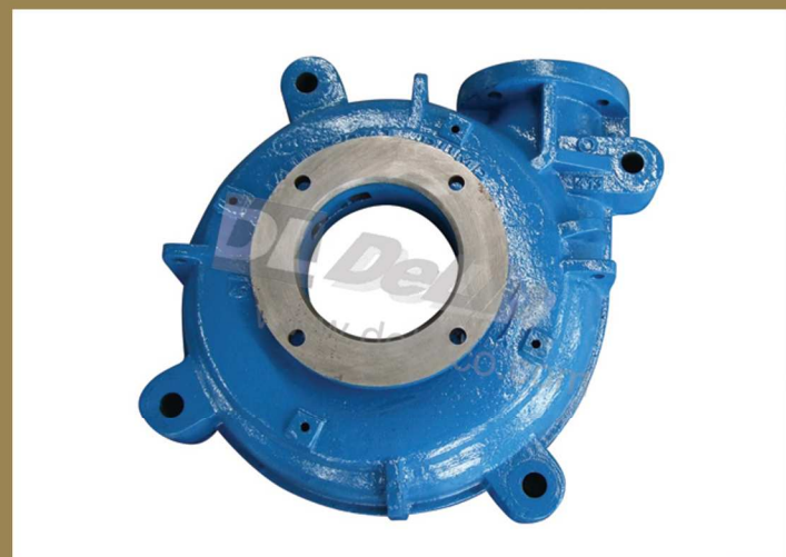
泵盖 (E4013) (Cover Plate)