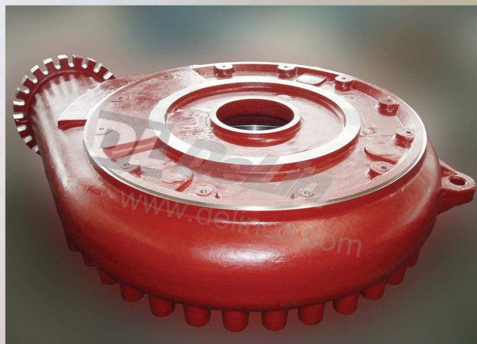
左侧泵体背面 (Left Of Frame Plate)