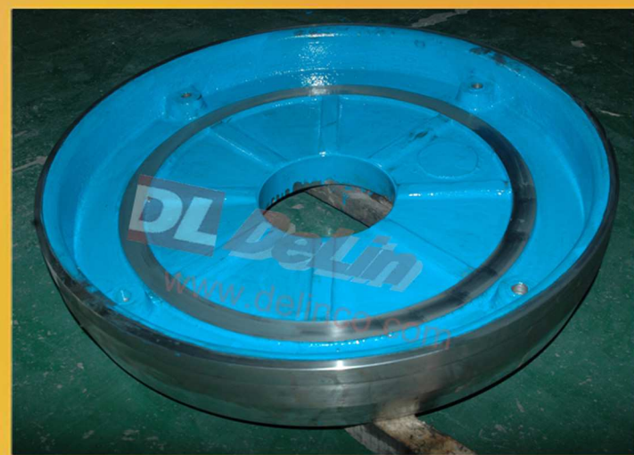
后护板 (GG10041) (Frame Plate Liner Insert)