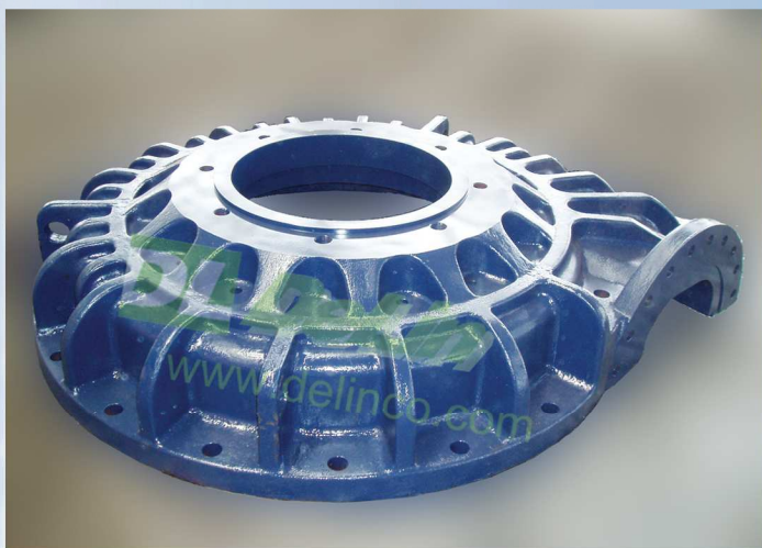
泵体 (2.5吨/件) (Frame Plate) (2.5t/pce)