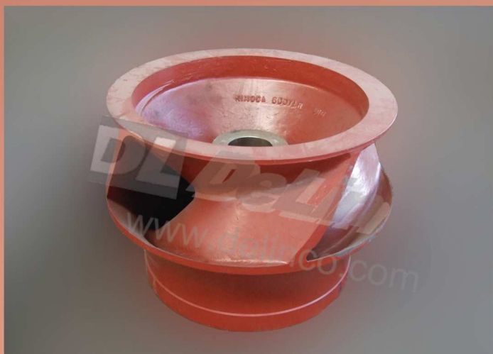
叶轮 ( 600TLR-010) (Impeller)