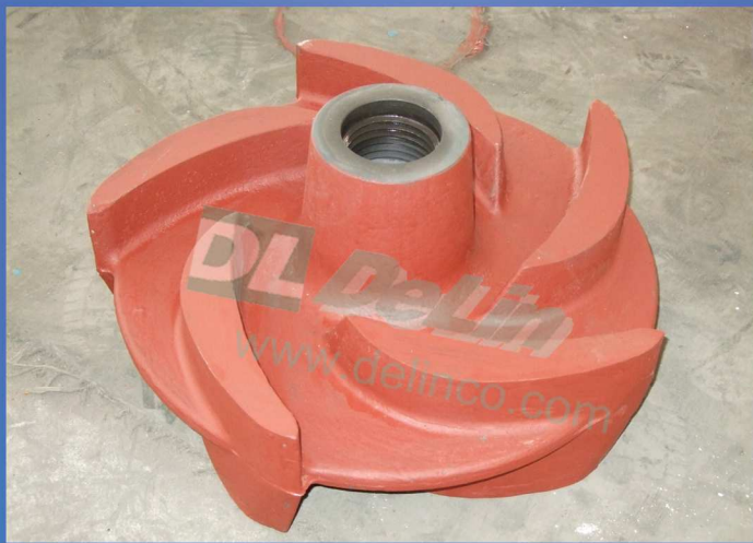
叶轮 (SP65206) (Impeller)