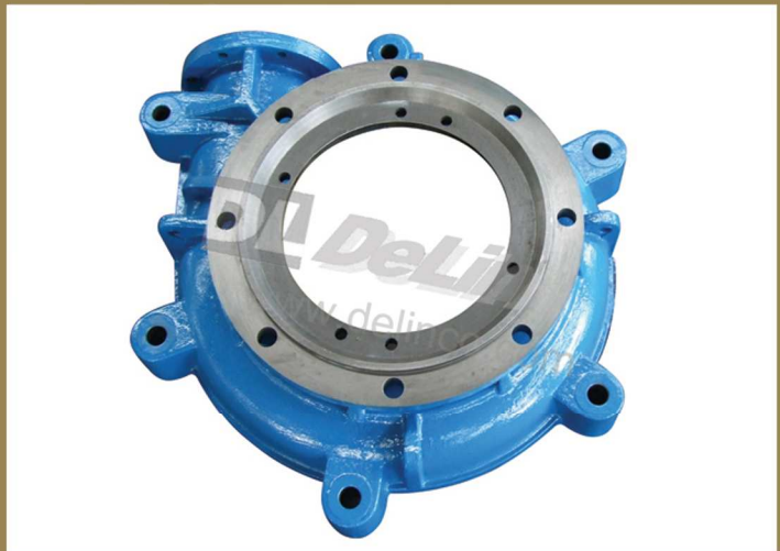
泵体 (F6032) (Frame Plate)