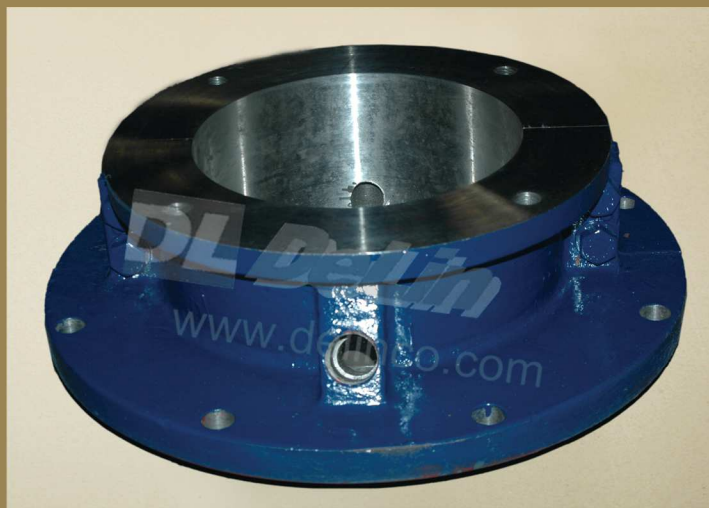
对开填料箱 (Split Packing Box)