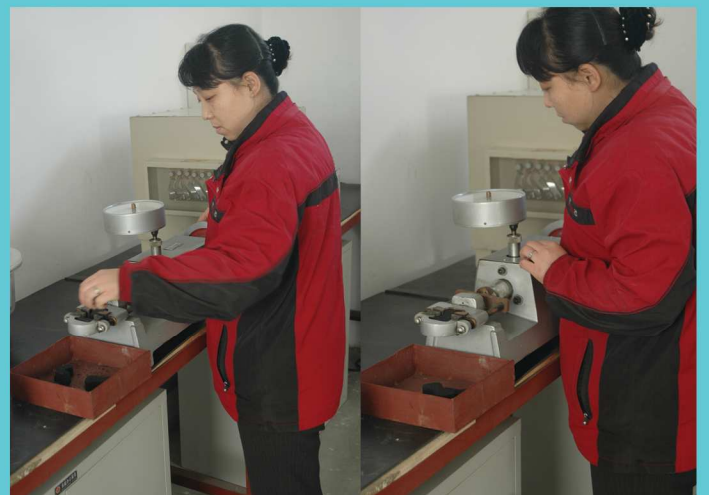
强度测试 (Strength Test)