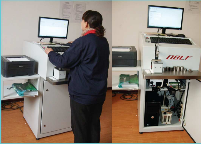
光谱分析仪 (Spectrum Analyzer)