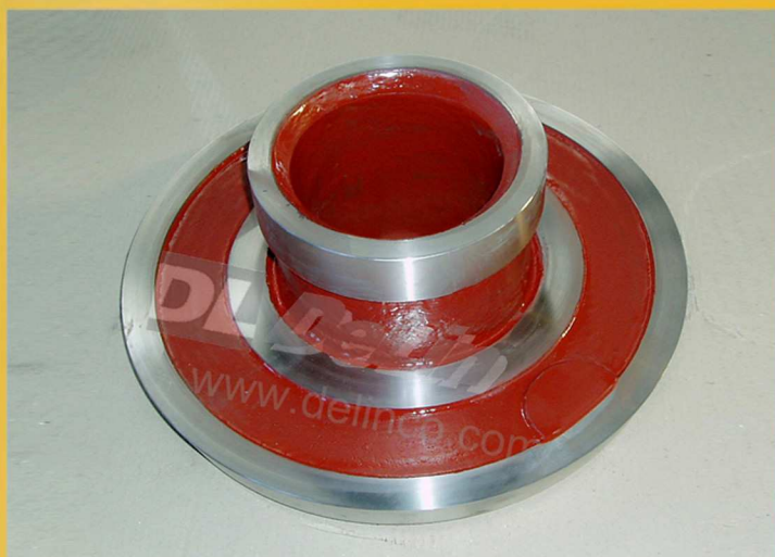
前护板 (E4083) (Throatbush)