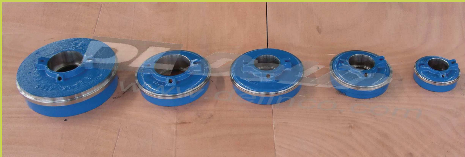
减压盖 (Expeller Ring)