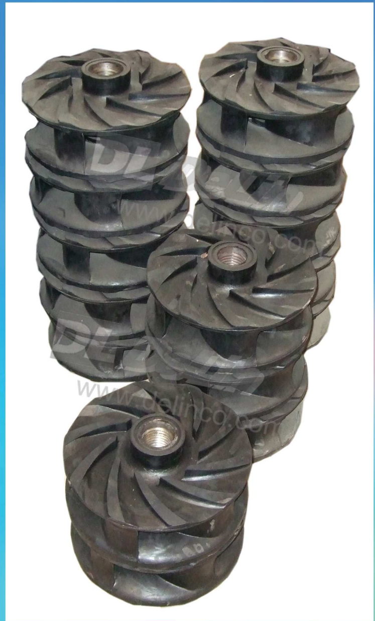
橡胶叶轮 (Rubber Impeller)