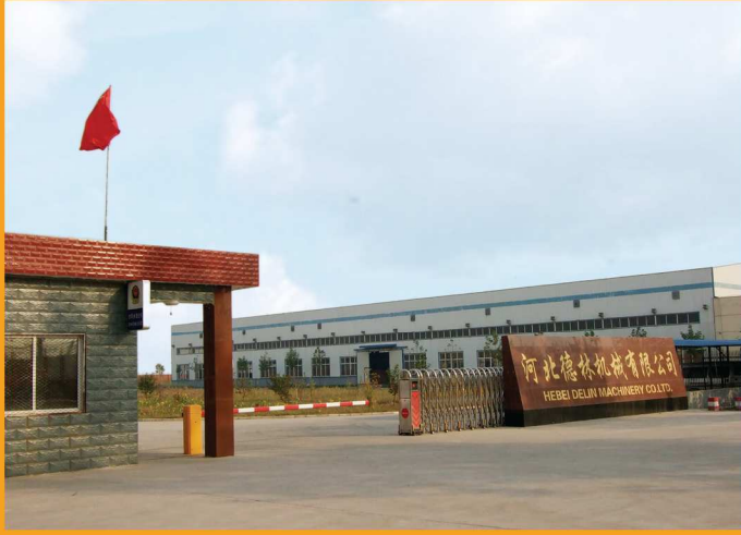
公司大门 (The Main Door)