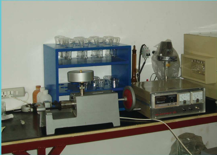
手动拉力测试仪 (Manual Tension Test Meter)