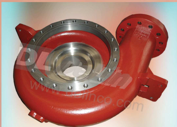
泵体 (Frame Plate) (球铁, 512公斤/件) (Ductile Iron, 512kg/pce)