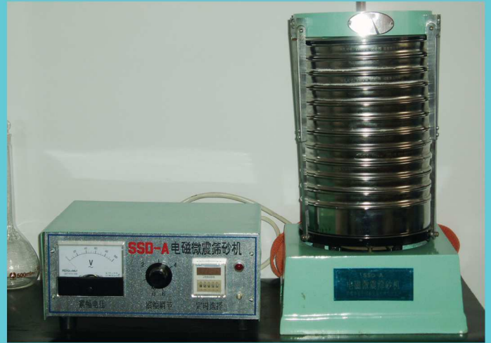
电磁微震筛砂机 (Electromagnetic Microtremor sand Screen)