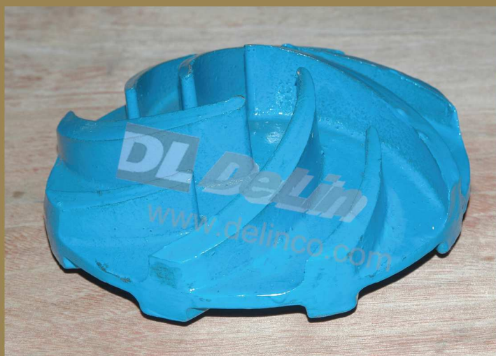
叶轮 (175053) (Impeller)