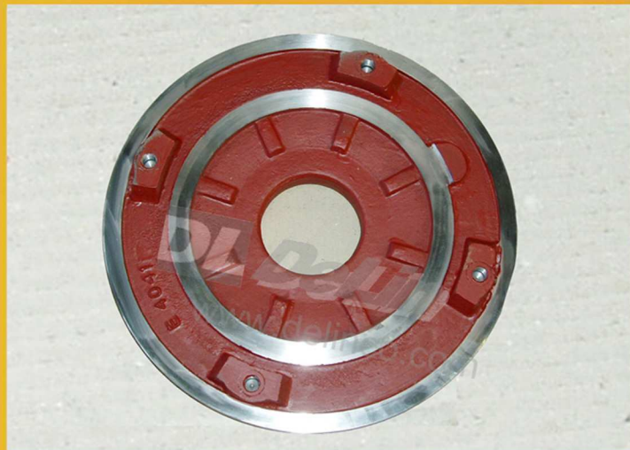
后护板 (E4041) (Frame Plate Liner Insert)