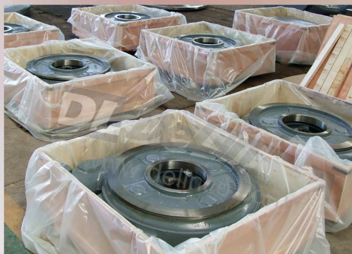
待发泵体 (Frame Plate For Shipping)