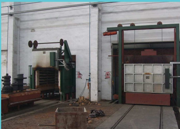
五吨和十吨热处理炉 (Five Ton And Ten Ton Heat Treatment Furnace)