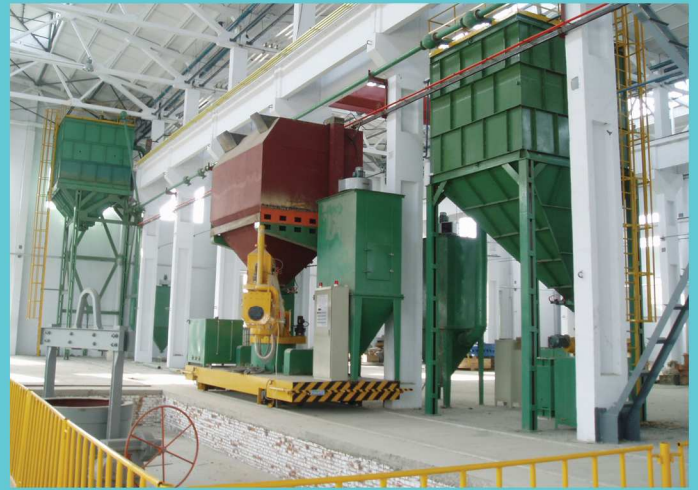
移动混砂机 and 储砂罐 (Mobile Sand Machine And Store Sand Tank)