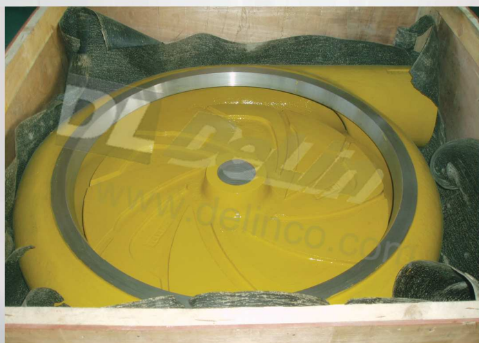
待发护套和叶轮 (Volute Liner And Impeller For Shipping)