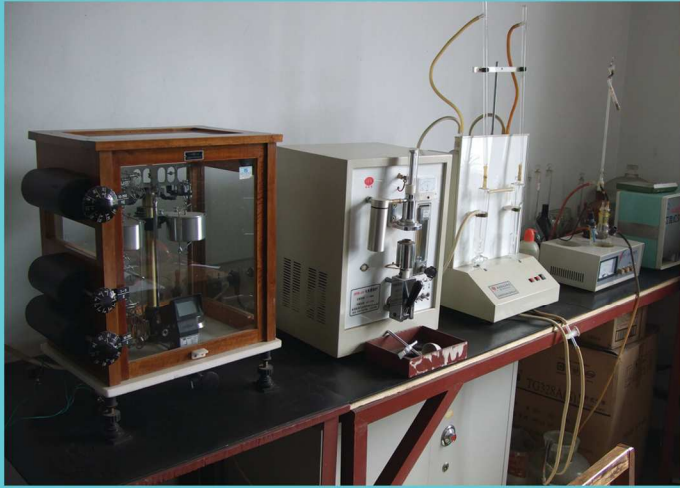
碳硫联测分析区 (Carbon Sulfur League Test Analysis Area)