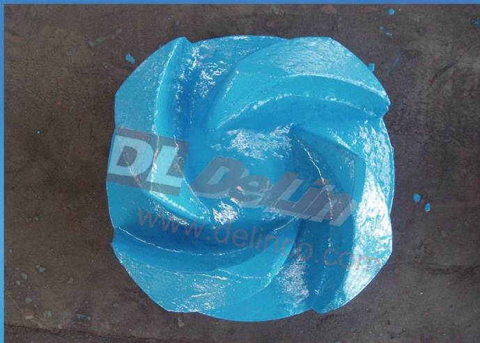
叶轮 (64056) (Impeller)