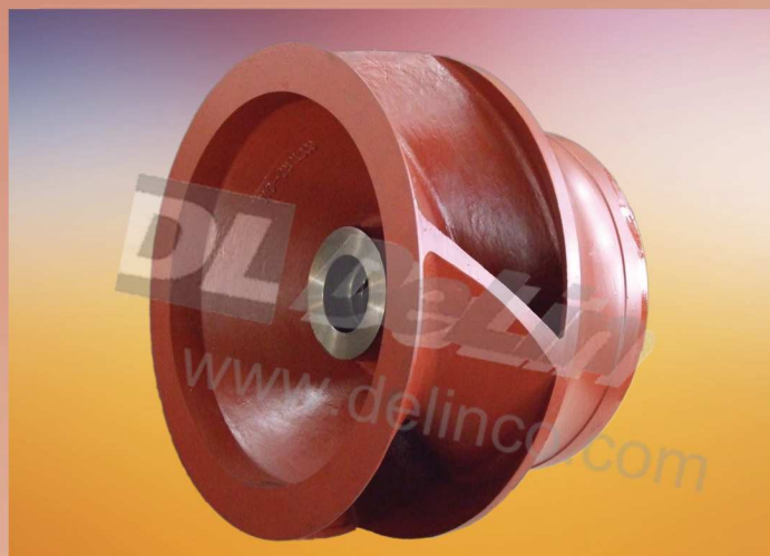
叶轮 ( 600TLR-010) (Impeller)