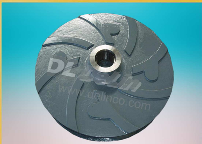
来图叶轮 (Impeller Asper Drawing Of Client)