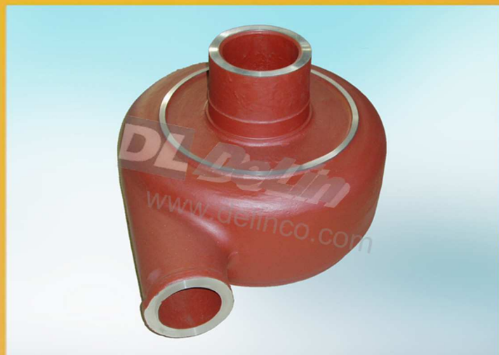
护套 (D3110) (Volute Liner)