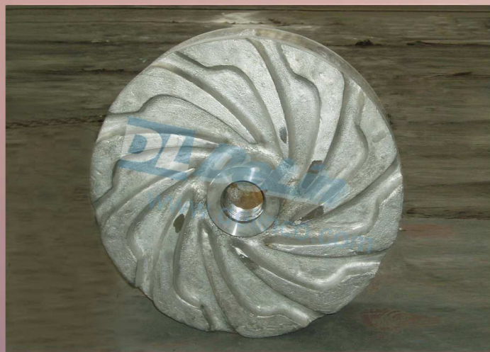
叶轮 (F6147) (Impeller) (304 不锈钢) (304 Stainless Steel)