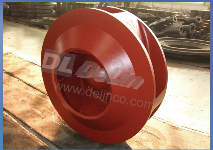
叶轮 (450WNA-010) (Impeller)