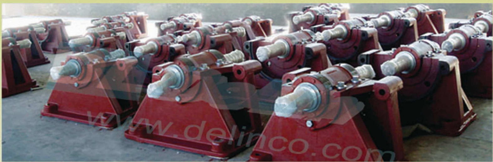
托架总成 (Bearing Assembly With Base)