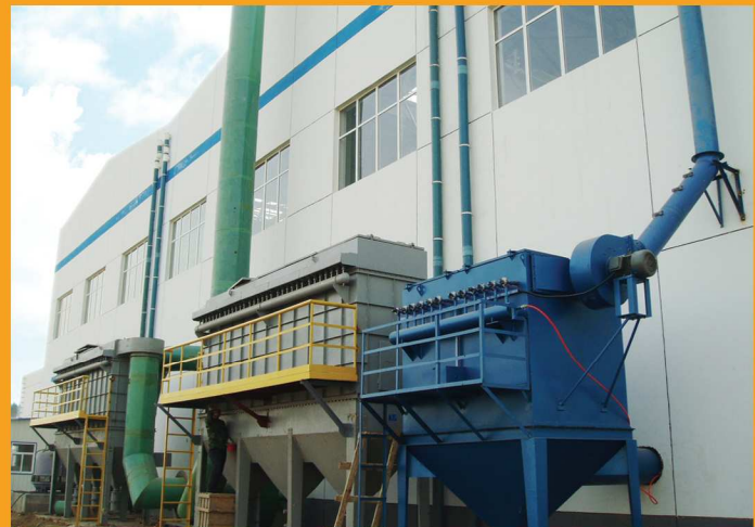
环保除尘器 (Environmental Protection Filter)