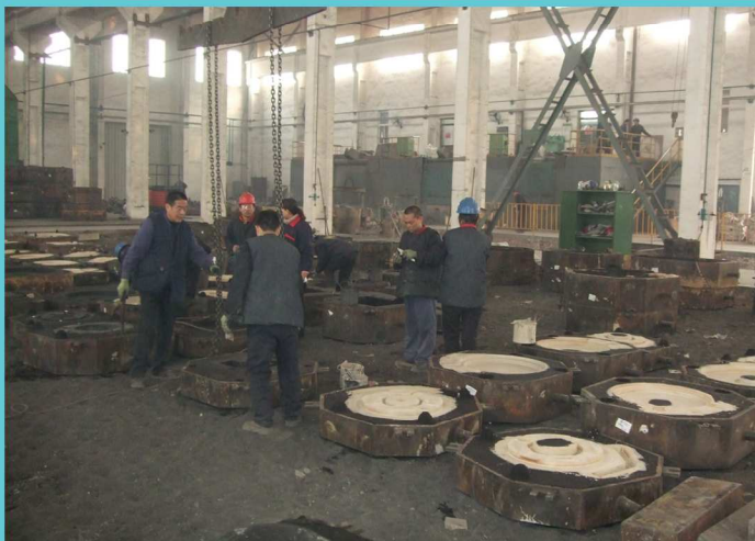
合箱区 (Joint Box Area)